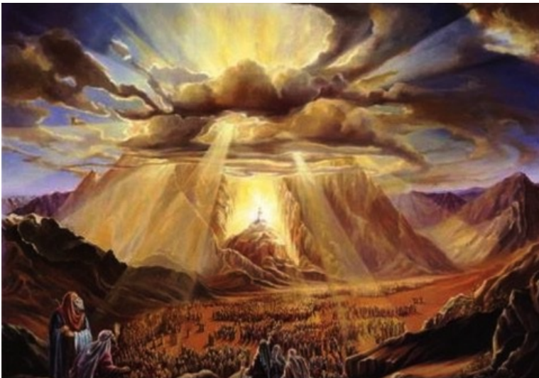
Mt Sinai

Exodus 31:18 When He had finished speaking with him upon Mount Sinai, He gave Moses the two tablets of the testimony, tablets of stone, written by the finger of God.